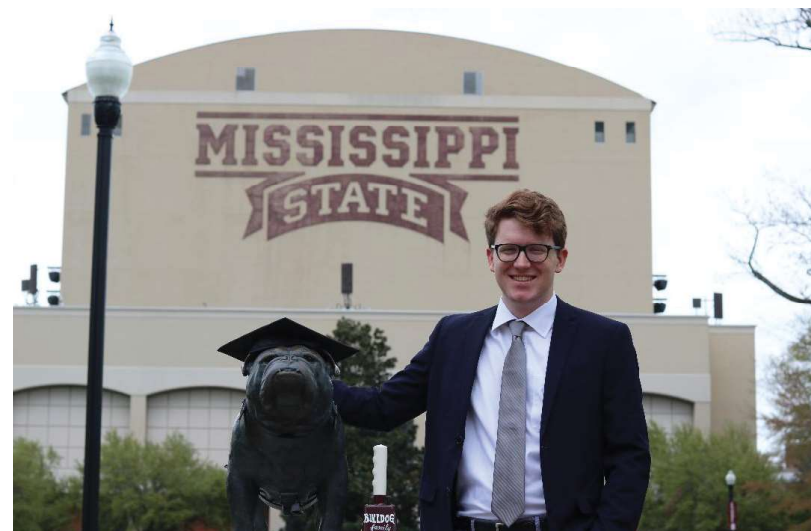
Mississippi State University School of Architecture