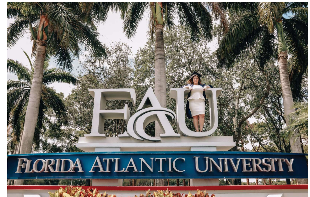
Florida Atlantic University, School of Architecture