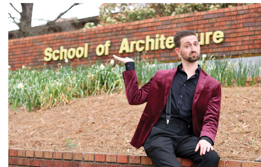
Mississippi State University